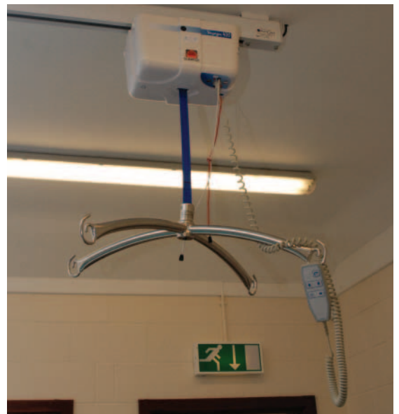
Hoists can be used to place animals in or remove them from a hydrotherapy pool or treadmill, although some dogs panic when they are lifted off the ground.

Many hydrotherapists prefer pools over underwater treadmills as they are considered to be more versatile and the hydrotherapist is closer to the animal, thus ena-