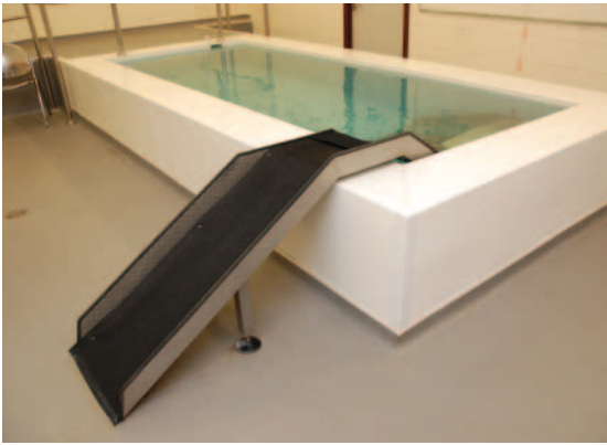
External ramps allow dogs to enter the hydrotherapy pool safely. Pools such as the one pictured also allow the hydrotherapist access from all sides.