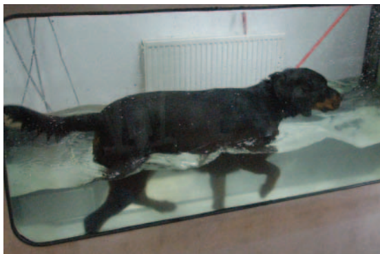
Treadmills tend to be better for fitness than fun swims.

It is important to use the correct water level when employing underwater treadmills, particularly when walking or swimming small dogs. Some chondrodystrophic, short-necked dogs can undergo extra strain on the spine if they have to lift their head above the water as they stride forward. The water levels used for walking should therefore be adapted in the light of the animal's size, condition and the desired effect. Depending on the equipment, this can be achieved by either adjusting the height of the walking surface or pumping water in or out of the treadmill. Particular care should be taken when exercising dogs in low levels of water, as this places a lot of weight on the joints while increasing the work done due to water resistance. This can lead to undue strain