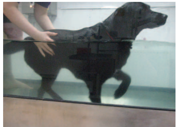
Different levels of water permit different levels of weightbearing exercise. It is important to remember that even large dogs working on underwater treadmills may panic; in such cases, changing the setup – for example, getting the dog to swim towards the handler – can help.