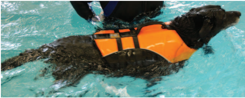
Buoyancy aids (above) and manual support from within the pool (right) are particularly helpful in the early stages of a rehabilitation programme. A wet suit is essential to protect the hydrotherapist from accidental injury from contact with claws