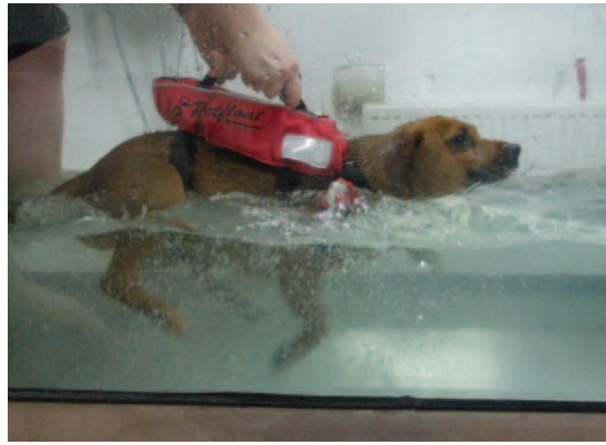
Animals undergoing supported swimming can safely exceed the range of movement achievable on land.

Other modalities of physiotherapy, which may be 'manipulative' and therefore fall under the Veterinary Surgeons Act, can be used in a more focused way (eg, restricted to one joint or one muscle area) and are particularly useful in cases where hydrotherapy is contraindicated (eg, in animals with cardiovascular impairment, skin con-