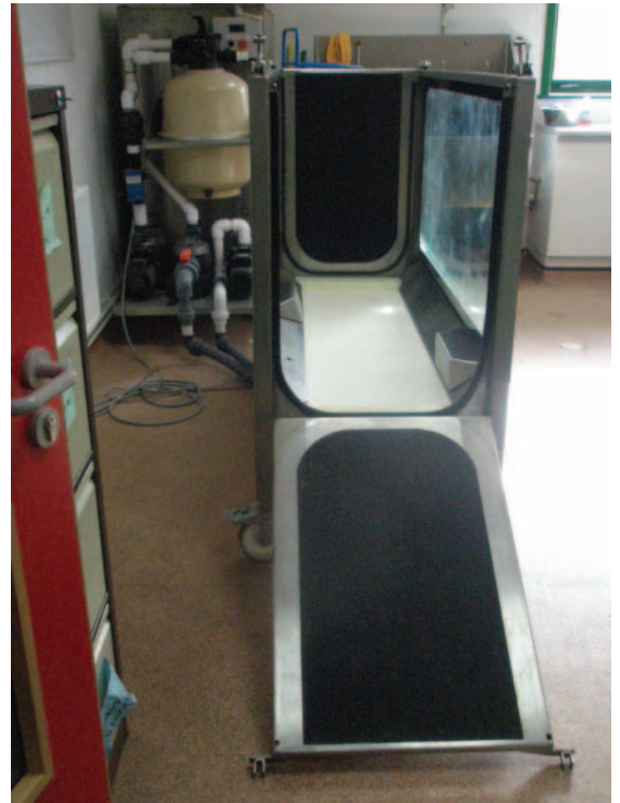
Underwater treadmill with a water filter and tank in the background.

and should be used sparingly unless the dog is being exercised for fitness and/or is a recuperating animal that is monitored extremely closely. The speed of the treadmill must also be chosen very carefully.