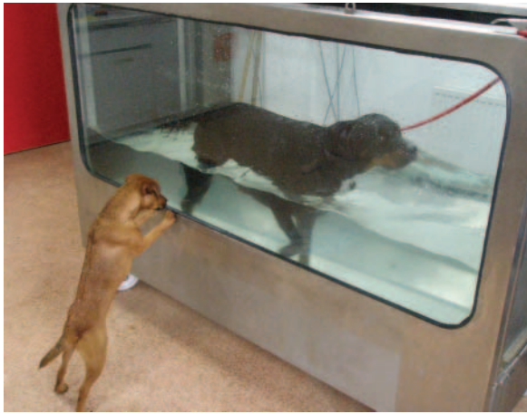
Owners are increasingly looking for additional therapies to aid the health and welfare of their pets.