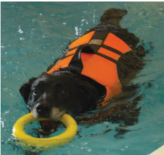
Toys can be used to encourage dogs to perform a range of movements and turning

The type of ramp leading to a hydrotherapy pool and the incline at which it is placed depends on a number of factors, including the condition of the dog to be treated and whether the pool is sunk into the floor of a room or built above it. A ramp may be needed outside the pool to allow the dog to walk up to the level of the surrounding wall, but all pools should have a ramp leading down into